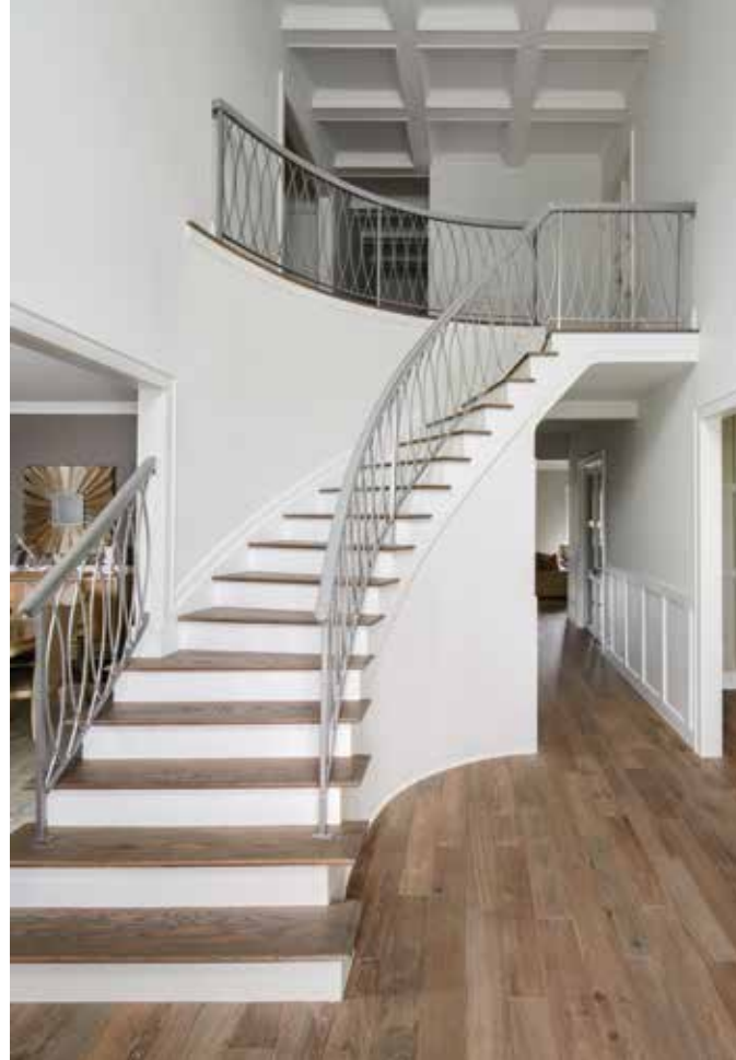
The foyer is finished in Benjamin Moore's Decorator's White, highlighting the beautiful art deco-inspired staircase railing.