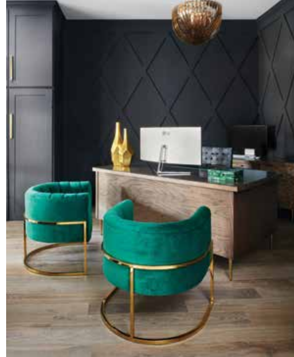
The office features a custom desk and wall paneling by AshMeg Construction.

height space, as well as a chandelier lift to enable easier cleaning of the new chandelier at the push of a button. The redesigned staircase features a rail with a metallic motif.