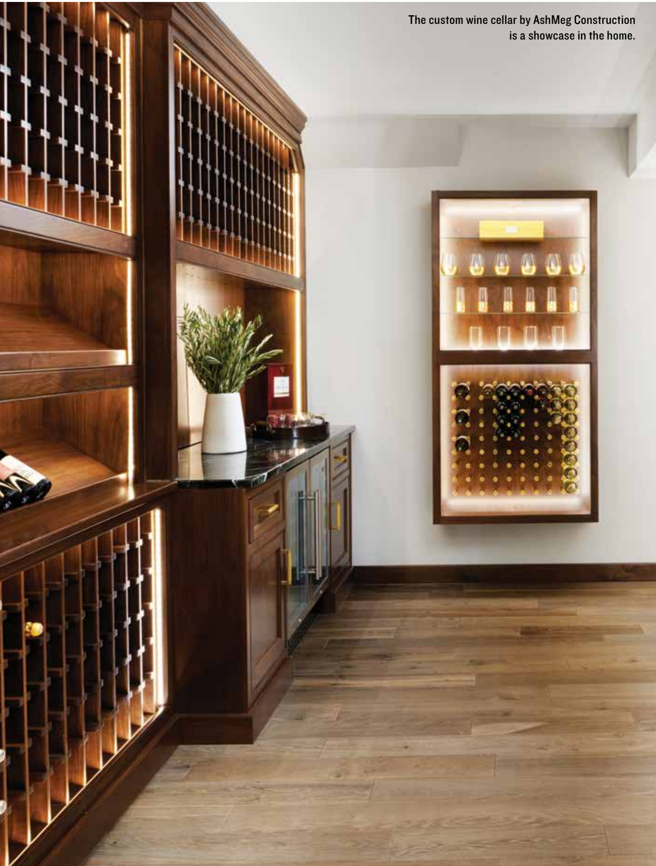
The custom wine cellar by AshMeg Construction is a showcase in the home.